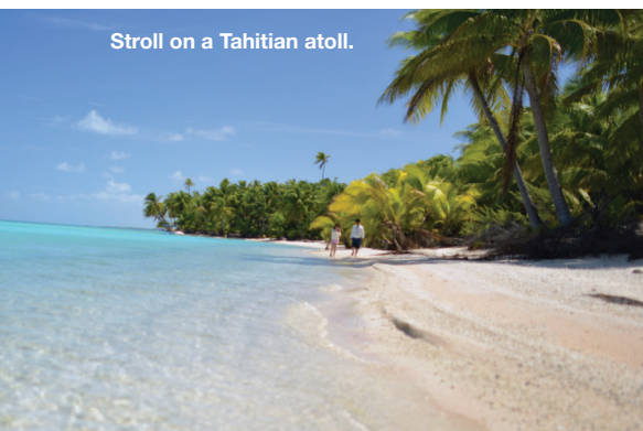
Stroll on a Tahitian atoll.

You, your mate, a desert island and a gourmet picnic—let these resorts whisk you away. by Sunshine Flint