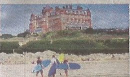
Bed and board: The Headland Hotel

Herman Melville based Moby Dick on Nantucket's whaling industry, which was at its peak in the 1800s. Read more at travelmail.co.uk