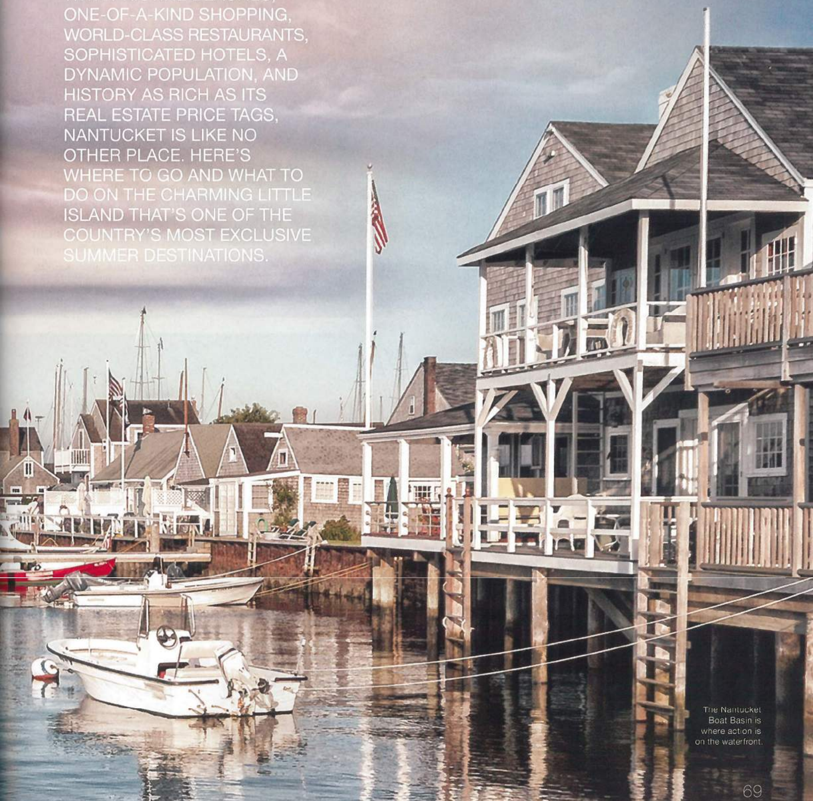
The Nantucket Boat Basin is where action is on the waterfront.

WITH PRISTINE BEACHES, ONE-OF-A-KIND SHOPPING, WORLD-CLASS RESTAURANTS, SOPHISTICATED HOTELS, A DYNAMIC POPULATION, AND HISTORY AS RICH AS ITS REAL ESTATE PRICE TAGS, NANTUCKET IS LIKE NO OTHER PLACE. HERE'S WHERE TO GO AND WHAT TO DO ON THE CHARMING LITTLE ISLAND THAT'S ONE OF THE COUNTRY'S MOST EXCLUSIVE SUMMER DESTINATIONS.