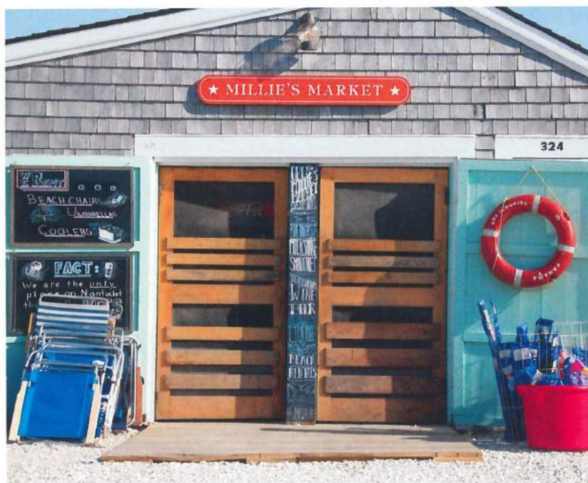
Clockwise from top left, Sankaty Head Light, the harbor is filled with boats of all sizes in the summertime, Millie's Market, and a classic jeep makes it way out to a secret beach.

Nantucket is all about the ocean, and the view from the Nantucket Boat Basin offers a truly spectacular