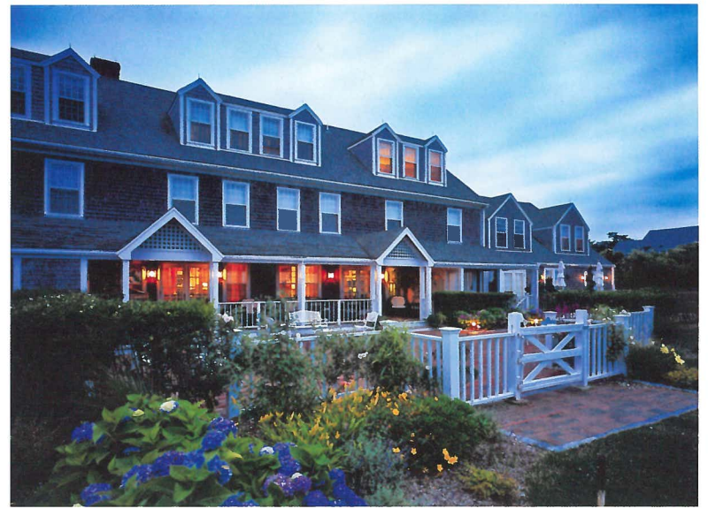
A SERENE RESPITE Nantucket is home to inns that blend sophistication and old-world elements, including The Wauwinet (above), which sits on two private beaches.

During the summer months, crowds descend onto Nantucket, a picturesque island just 30 miles off the coast of Massachusetts. When the multitudes disperse after Labor Day, you'll find yourself immersed in old-world charm and a newfound tranquillity, surrounded by wind-swept bluffs, lighthouses and crimson moors. The cooler days provide perfect weather for pedaling the nearly 30 miles of designated bike paths, shopping for antiques along cobblestone streets, sipping a Whale's Tale Pale Ale at Cisco Brewers or watching berries being harvested at the annual Cranberry Festival. E.B. White wrote that there are three New Yorks, but here we'll show you there are three distinct sides of Nantucket.