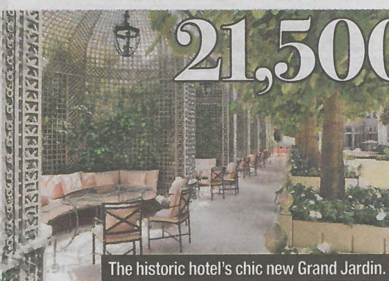
The historic hotel's chic new Grand Jardin.