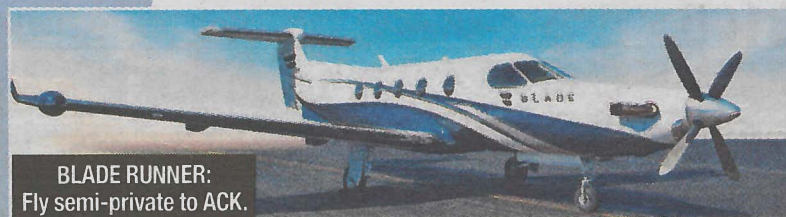
BLADE RUNNER: Fly semi-private to ACK.