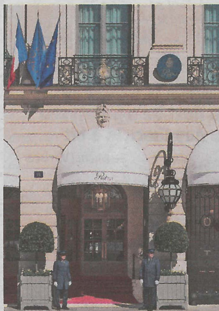
The iconic Ritz Paris after its $450M face-lift.

Find Your Next Career in the NEW YORK POST Classified Employment Listings