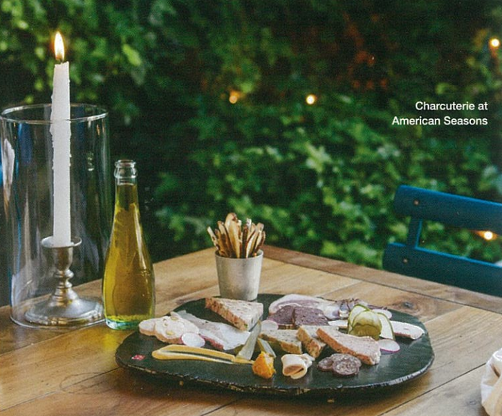
Charcuterie at American Seasons